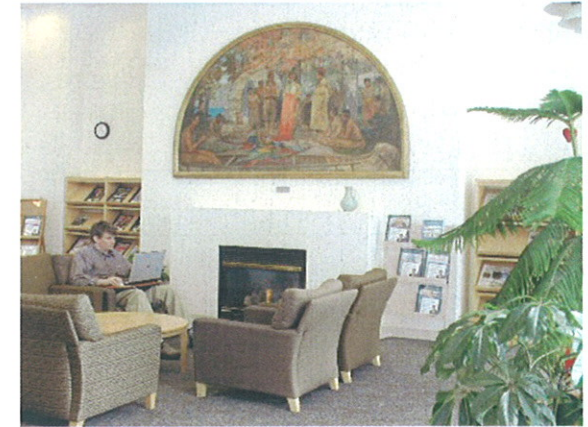
Quiet Reading Room